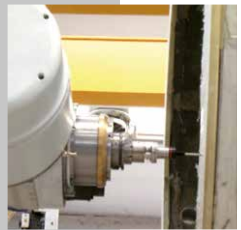
automatic blade alignment