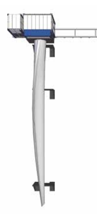
single or double operating unit drilling / milling / T-bolts insertion