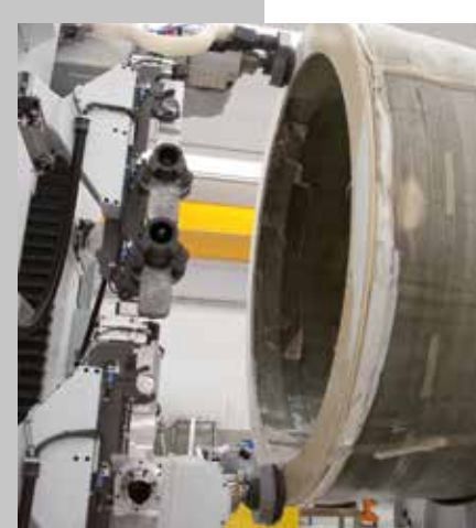
simultaneous machining with two operating units