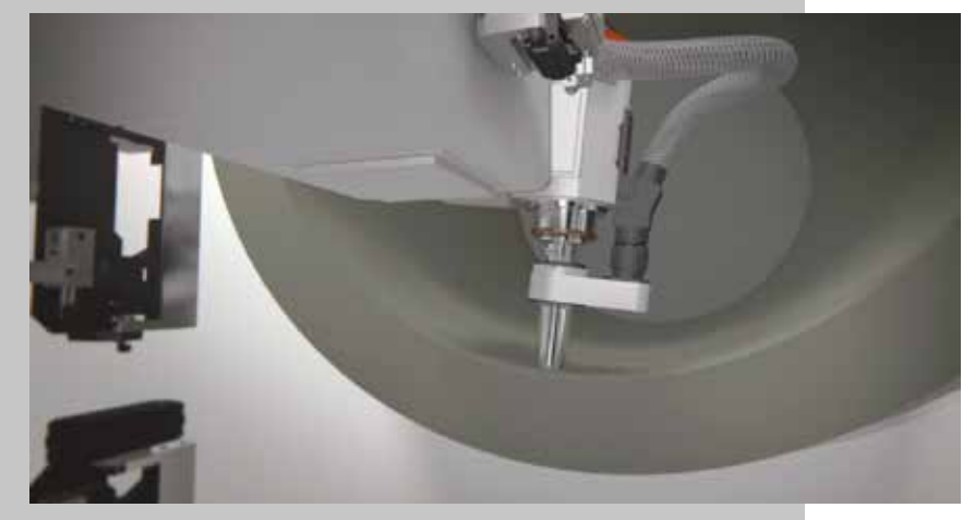
due to the unique technology of CMS tool cooling systems are not required